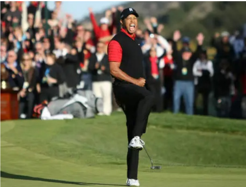
Tiger Woods celebrates winning the Hero World Challenge for the 5th time back in 2011 at Sherwood CC.

Founded in 1989, Sherwood CC has a rich history of hosting PGA Tour events such as the Shark Shootout, hosted by Greg Norman, the World Challenge, hosted by Tiger Woods, as well as the 2020 ZOZO Championship. Before the course, Sherwood was also the location for several television shows and movies, most notably, the 1923 version of Robin Hood, starring Douglas Fairbanks, and the 1938 version, The Adventures of Robin Hood, starring Errol Flynn. Years later, both the golf and tennis clubs continue to be popular for a variety of film and television shoots.