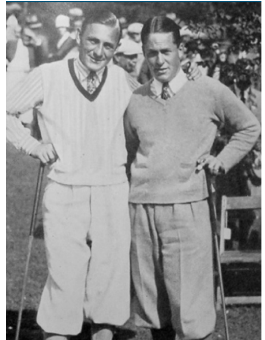
George von Elm (1922, 1925, 1927)