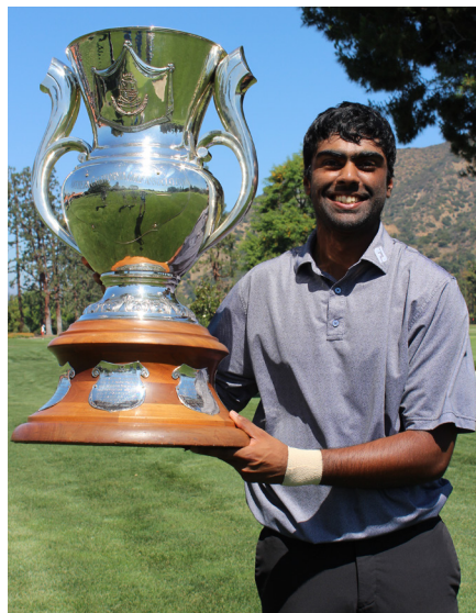
Sahith Theegala (2019)