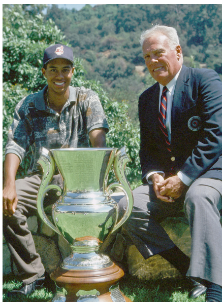
Tiger Woods (1994)

Among those who have tried to win the SCGA Amateur and failed are Craig Stadler, Scott Simpson, Corey Pavin, Mark O'Meara, Phil Mickelson, Duffy Waldorf, Jason Gore, Rickie Fowler, Xander Schauffele, and Aaron Wise.