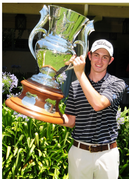
Patrick Cantlay (2011)