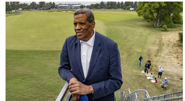
LOS ANGELES TIMES