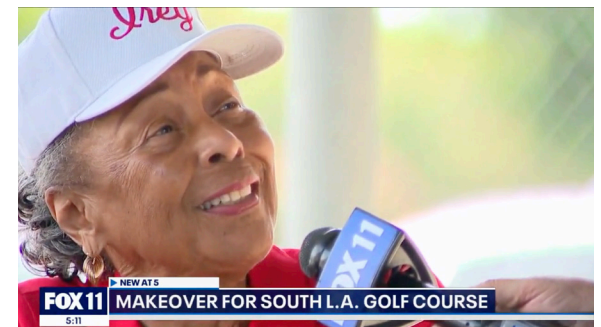
FOX LOS ANGELES