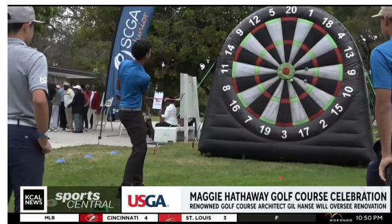
CBS LOS ANGELES